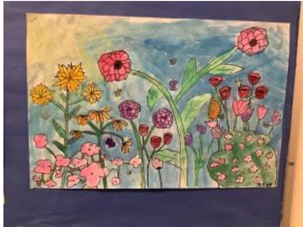
2 - DIVISION 7 SPRING ART