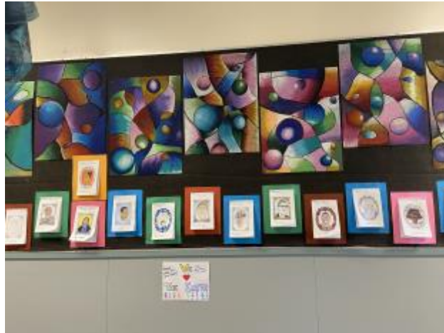
4 - DIVISION 5 ARTWORK AND PROJECTS