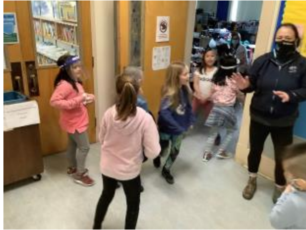
1 - DIV 11- APRIL FOOLS!!!