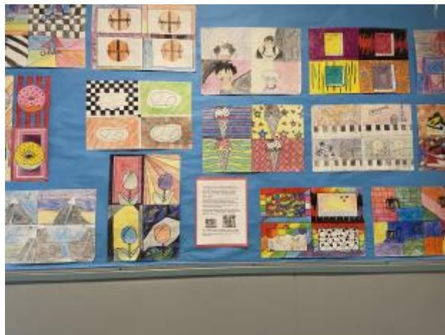
5 - DIVISION 3 POP CULTURE PROJECTS