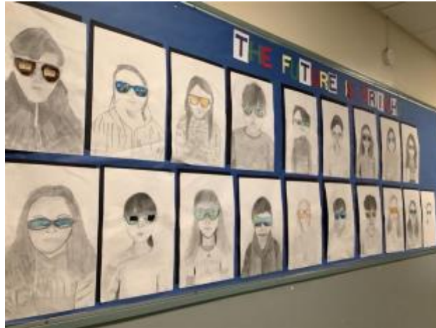
3 - DIVISION 6 ARTWORK

Students used the grid method to draw a portrait of themselves from a photograph. Then used shading and blending techniques to finish it off, finally creating a reflection of something they would like to see in their future.